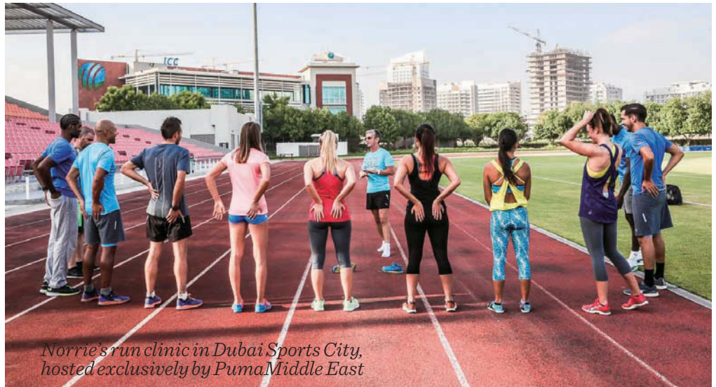
Norrie's run clinic in Dubai Sports City, hosted exclusively by Puma Middle East

Shin splints is a wide term, but one of the major reasons why they happen is because people are wearing shoes that have too high of a heel at the back, and are rigid. So you'll hear yourself run when you're running, and it'll be a loud noise slapping down with every footstep. Running, as opposed to jogging, is about landing on the ball of your foot. If anyone says you must run heel to toe, this is incorrect—the easiest way to prove that when you're running, is to take your shoes off and just run across a floor. Immediately, you'll land on the ball of your foot. So in order to be able to do that with a shoe, you can't go higher than about 12mm difference between the heel and the midsole. If it is, it tends to force you to land heel to toe, which means you'll land on the outside and slap the ground if it's a rigid shoe. A less rigid shoe will allow you some flexibility. It doesn't matter what the speed is, it just depends on where you land on the ball of your foot, how you should be landing when you run. Shin splints thus usually comes down to your choice in shoes. Which is why one of the things I usually focus on when holding